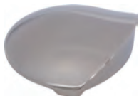
Polished Nickel Soap Dispenser: B-856 Matching Faucet: B-8876