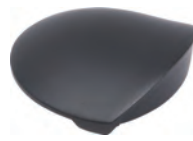
Matte Black Soap Dispenser: B-852 Matching Faucet: B-8872