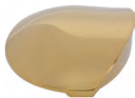
Polished Brass Soap Dispenser: B-850 Matching Faucet: B-8870