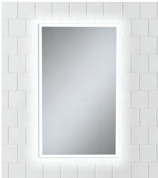
B-167 Backlit Series Standard Sizes: B-167 2436 B-167 2448 B-167 6642