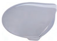
Polished Chrome Soap Dispenser: B-858 Matching Faucet: B-8878