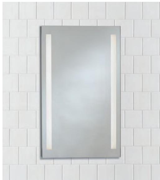
B-169 Sidelit Series Standard Sizes: B-169 2436 B-169-3040