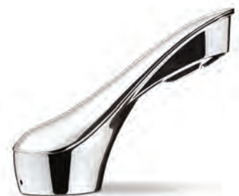
Automatic Faucet Available in matching finishes. Adjustable time-out durations, line purging, adaptable sensor range, LEED flow-rate options.