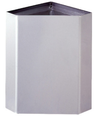
B-268 Surface-Mounted Corner Waste Receptacle