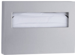
B-221 ClassicSeries® Surface Mounted Seat-Cover Dispenser