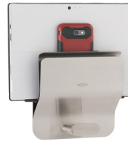
B-635 Klutch Mobile Device Holder