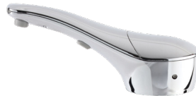
B-824 SureFlo®, Top Fill Liquid, 1.0-L

Find hygienic product solutions and more education at bobrick.com