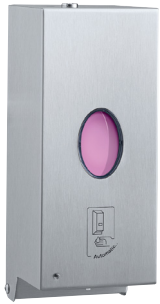
B-2012 Automatic Wall-Mounted Soap Dispenser 850 ml