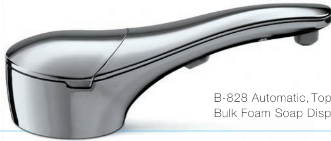
B-828 Automatic, Top-Fill Bulk Foam Soap Dispenser