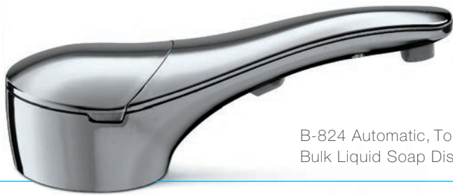
B-824 Automatic, Top-Fill Bulk Liquid Soap Dispenser